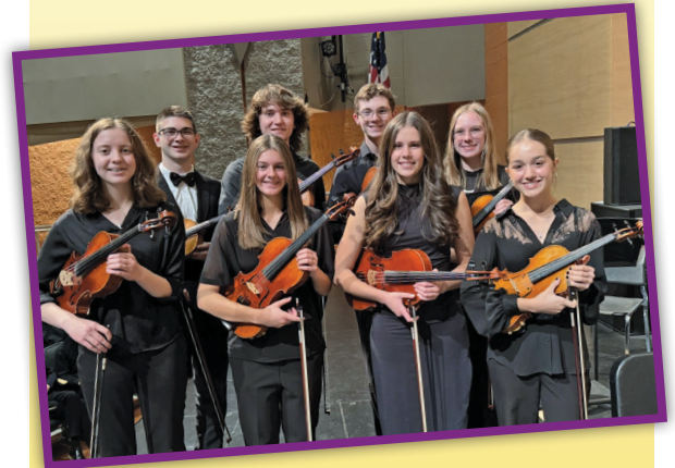
Congratulations to the string students who performed at Regional Orchestra at Ashland High School. We are proud of you!