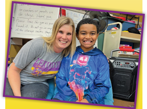
A great day of learning at Central, where building strong relationships is always a top priority.