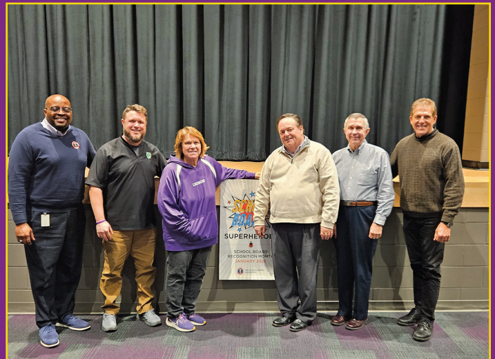
In January, the Ohio School Boards Association recognized our five board members for their service. Thank you for your dedication to our schools and community.

We thank our Board of Education for their tireless dedication to shaping the future of Lexington Local Schools.