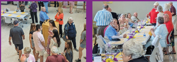
Lexington alumni gathered for a special evening to reconnect, share memories, and support future graduates. Thank you to everyone who attended and continues to support our students.