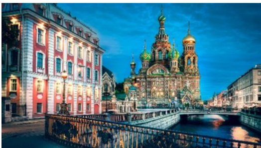
(St. Petersburg, Russia)

Russia was supposedly attacked by a terrorist group based on a recent bombing to the local metro in St. Petersburg. There were allegedly two bombs, one of which was able to be deactivated before going off. The first explosion killed at least 10, and injured around 43 people. Despite this horrific event, St. Petersburg is a fascinating, cultured, and historically rich city.