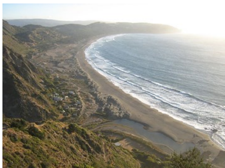
(coastal line of Chile)

Chile's coastal line expands 2,670 mi across the western half of South America. Throughout Chile's surrounding waters are numerous islands that are territory of Chile, such as the Pacific islands of Juan Fernández, Salas y Gómez, Desventuradas, and the famous Easter Island. Easter Island is well known for its statues created by the Rapa Nui people called Moai.