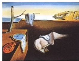
(One of Dalí's most famous paintings, "The Persistence of Memory")

In order to pull this off, the students must cut and tear parts of the shoes, which has proven to be more difficult than initially expected. One student explained, "I never realized how nice quality Vans were until I started ripping them apart".