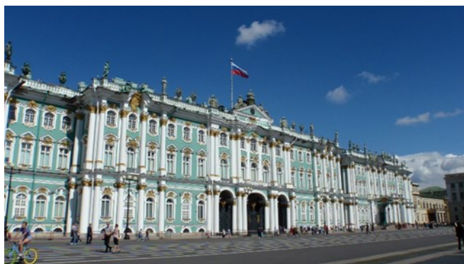
(The Hermitage Museum)

St. Petersburg is widely known for its role as the birth place of the famous Romanov mystery, but there is more to this Royal city than a mere conspiracy theory. One of St. Petersburg's most well-known art museums is The State Hermitage Museum. This art and culture museum is one of the largest and oldest museums in the world. The museum was first founded in 1754 by Catherine the Great but wasn't open to the public until 1852. The Hermitage Museum is a complex composing of six buildings, five of which are named the Hermitage Theatre, Old Hermitage, New Hermitage, Small Hermitage, and the Winter Palace.