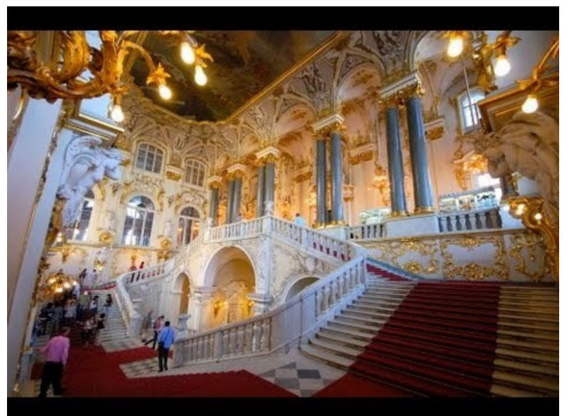
Five minute online tour

Evidently, St. Petersburg is one of the most intriguing cities in the world. The Hermitage Museum isn't the only cultural aspects of St. Petersburg but definitely one of the most notable.